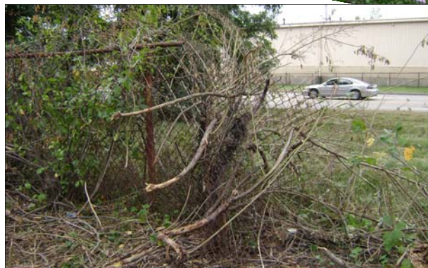
Top: Oakland Ave. before fence removal. Bottom: Oakland Ave. after fence removal.

The dilapidated fencing that lined U.S. Route 422 through the Brier Hill neighborhood is gone now with prompting from Lien Forward Ohio and quick work by the city street department, giving one of the city's main gateways a much cleaner look.